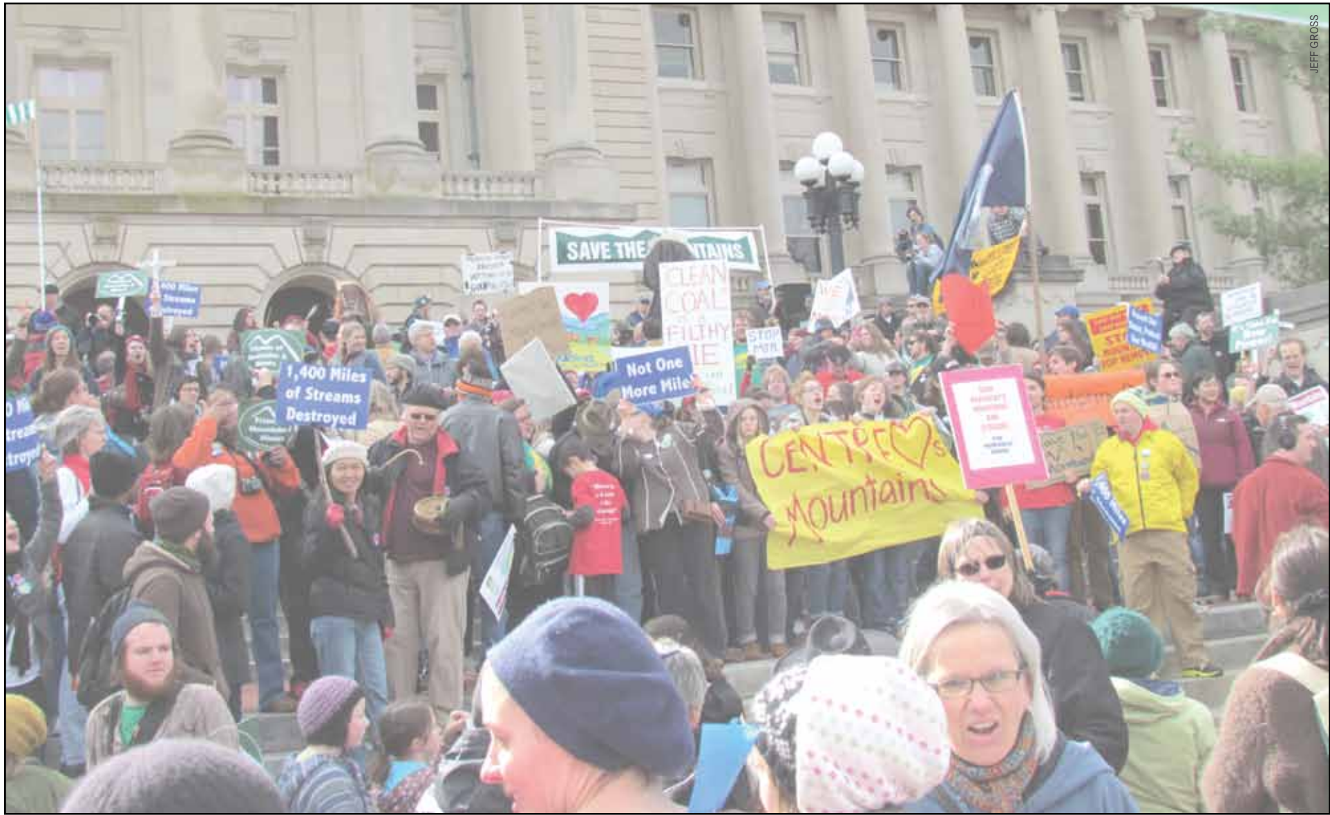
Demonstrators gather in front of the Kentucky State Capitol for “I Love Mountains Day,” held this year on Valentine’s Day.