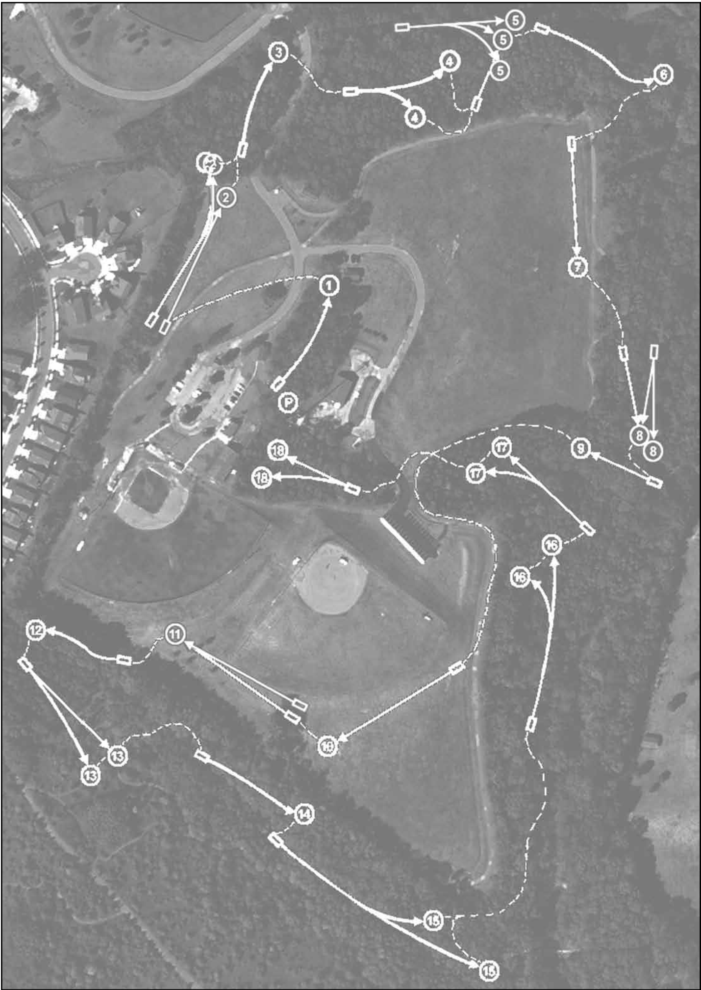
Proposed changes to the disc golf course at Veteran’s Park.