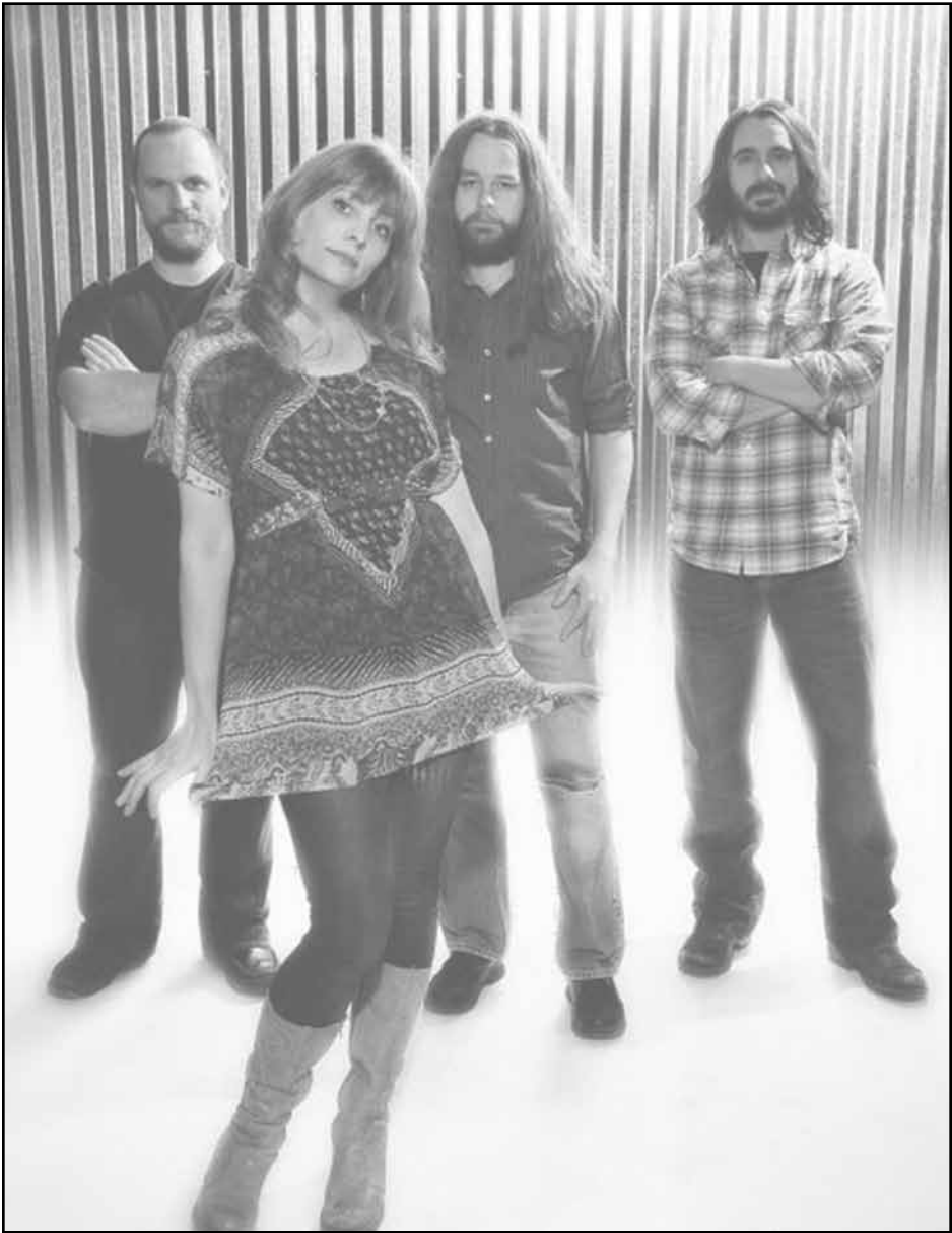
The Fervor creep and build at Cosmic Charlie’s on the 21st.