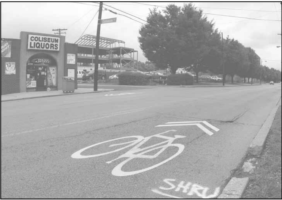
Sharrows on Rose near Euclid.

There was some good feedback online from the “Hold the Line” installment of “Out on the streets, that’s where we meet.” An anonymous reader posted about hauling ass downhill on S. Limestone approaching Vine. “If I’ve hit green (light), I’m at 25 mph anyway and having to slow for cars. I give a friendly wave. Sadly, only 50% of motorists right turn signal on Vine (it’s one way, so why signal?) meaning you must take the lane and assume that they don’t see you.”