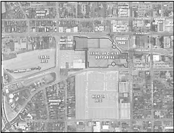
Opportunity zones.

will dictate a Rupp renovation, which will require less city funds, rather than a Rupp re-do; (3) that any re-do requires the geographic scope to greatly increase into a “district”; and (4) anything done must be bona fide first-rate, real world class. From the University of Kentucky side of things, basketball coach John Calipari, whose $4 million annual salary is provided by the privately funded UK Athletic Association, was the first to state the need for UK Basketball to remain a “gold standard” program.