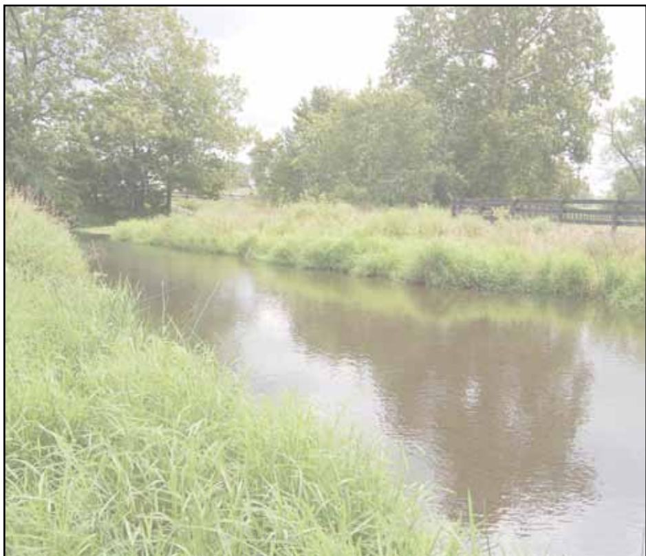
Cane Run Creek.

The southern end of the 29,000 acres that comprise the Cane Run Watershed starts on the north side of Lexington and extends all the way to Georgetown. Driving down New Circle Road, it's hard to believe that you are traveling alongside an endangered ecosystem, for the path of flowing water has been heavily manipulated by the urbanization of the area. Most of the ground in this area is impermeable, and during heavy rains, the high