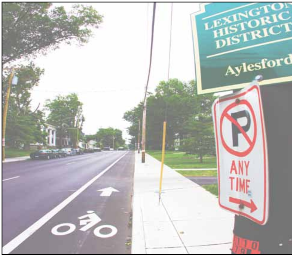
New bike lanes on Maxwell near Rose.

“Umm, I don't know—the side near the big mall thing?”