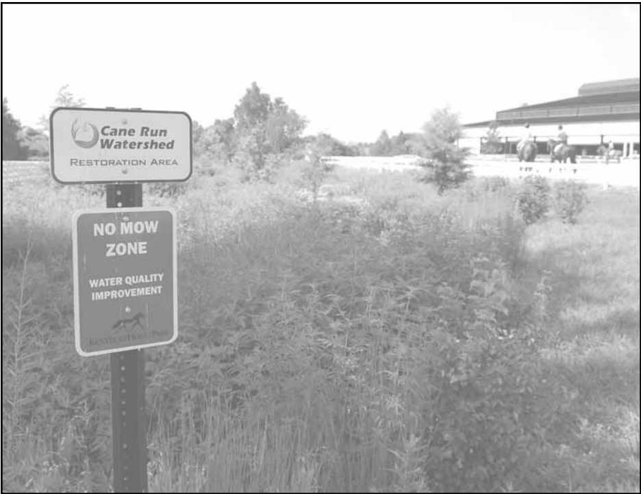
No-mow zone near horse barn.

Attendees can register at canerun2011.eventbrite.com . The flora and fauna of Cane Run Watershed would like to thank the Cane Run Watershed Council, the UK College of Agriculture, the Lexington-Fayette Urban County Government, the United States Environmental Protection Agency, and Friends of Cane Run for their work. For more information visit www.canerunwatershed.org .